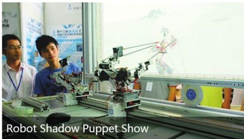
Robot Shadow Puppet Show

What kind of fun stuff are makers doing? You will be communicating with makers from home and abroad, getting to know their stories, and how do they achieve their goals by making ideas come true. Not only technology creations will be here, hand made products, steam punk retro vintage equipment, and traditional skills from China makers of older generation.