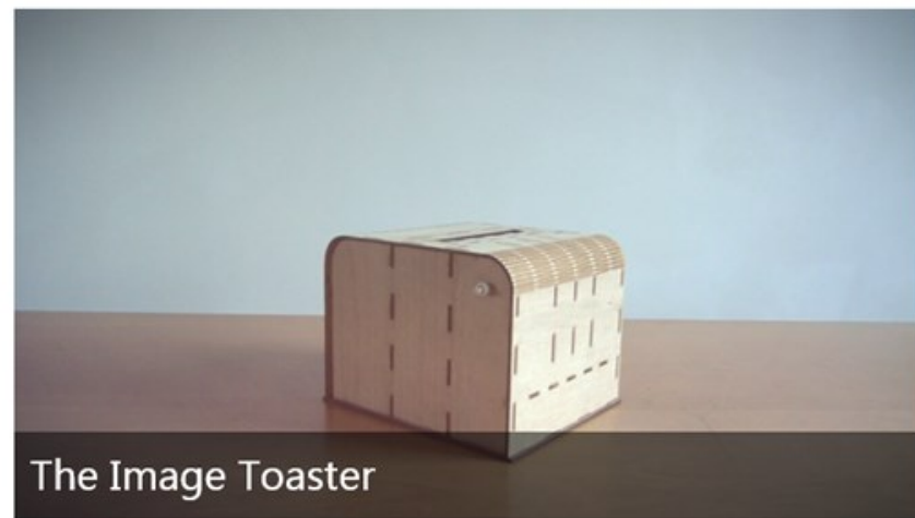
The Image Toaster