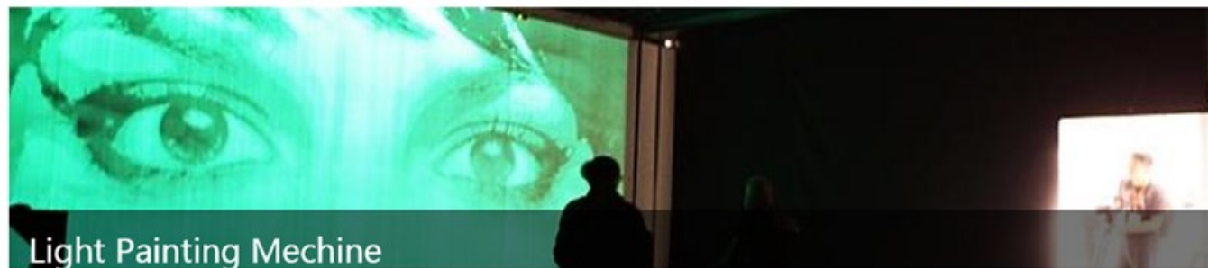
Light Painting Machine