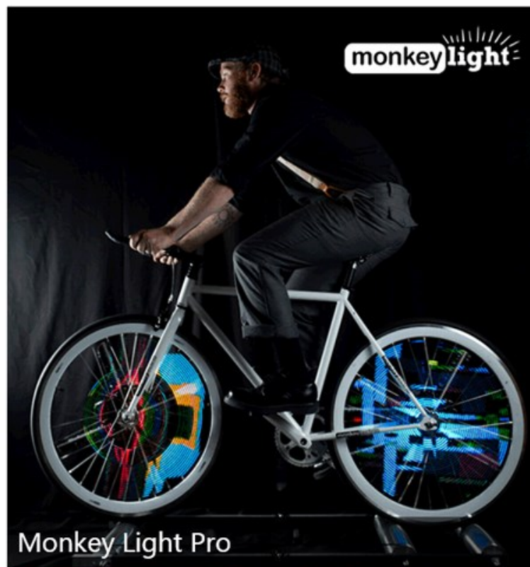
Monkey Light Pro

LED, LED, LED, those that light up the night sky are not just fireflies. Making bicycle tires play animation, making wishing bottles sing and shine, and remotely controlling your robot fireflies through your phone are all possible. The dark room is filled with different colors of makers' lighting projects.